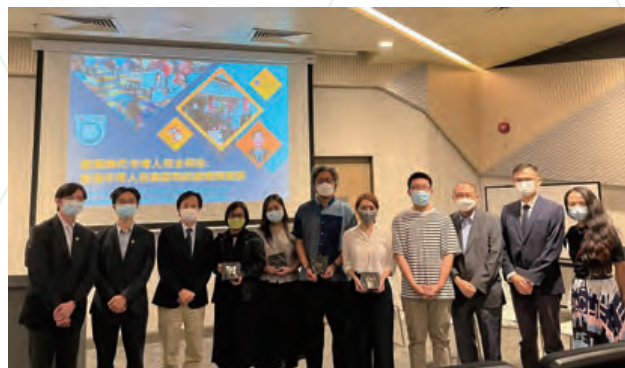
The research team and guest speakers of the seminar: Youth in Turbulent Times: Constructing and Strengthening Youth Identity in Hong Kong (UGC/IDS(C)/15/H01/19)